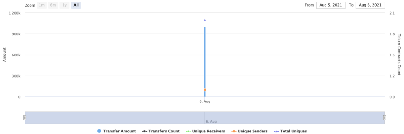
Token Contract 0x6fdefd240f059a50dc08eda3431f0df9ab765f83 (BakeryDoge) Source: BscScan.com